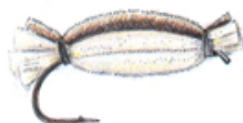
Furry Foam Bread & Crust Fly